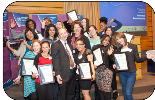
Award winners at the 2014 awards Ceremony

10. Learn about the values of the NMMU and practice them in your daily life. Develop your own personal value system.